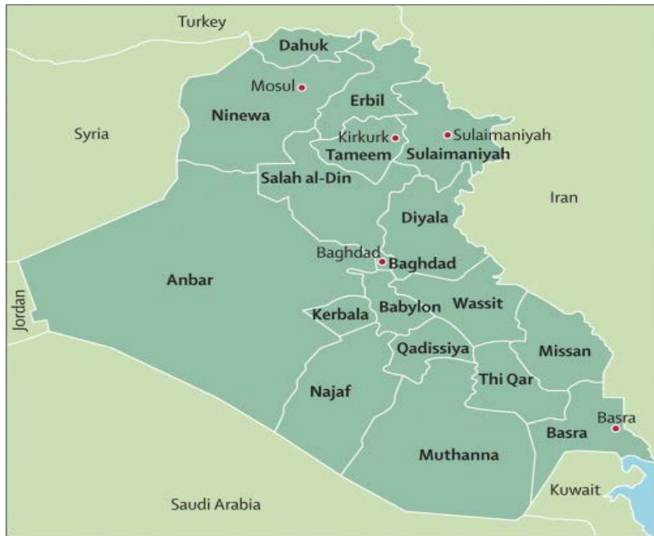
Fig. 1: Iraq's 18 provinces and surrounding countries

Some of the examples used were that 11 medical faculty members have been killed and that a total of 71 staff have lost their lives from 13 departments at Baghdad University (Burnham et al. , 2009).