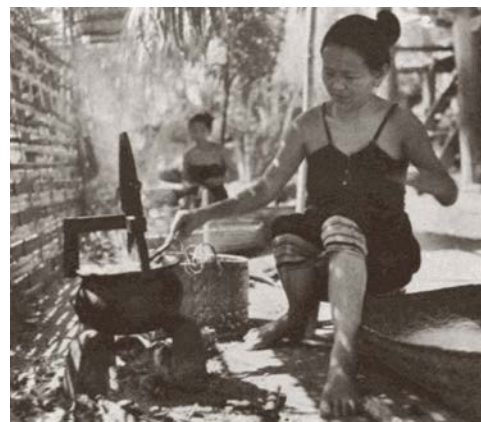
Fig. 1: The silk filature by a Vientiane woman. Cited infacebook.com/once upon a time in Laos Lane Xang

Although, the various patterns of Lao woven fabric, their origins are still unknown because of the migration of Lao people into Vientiane during the war in transition