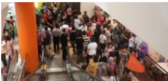
Fig. 4: The visitors activity waiting for sitting and queuing for foods

goes back to her hometown we do not bother to cook and clean our households alone. Going to mall like this is more practical, after we eat, huddle with our family and the kids can play in Amazone or other playing areas that are close to this eating area' as he said. Tunjungan Plaza still opens on The Eid and the visitors are increasing, especially in the eating area, all restaurants, foodcourt is full-loaded, other stores also full of people who shops or just looks around. In brief, those above description can be seen on Fig. 5. Based on the mentioned information units,