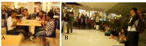
Fig. 1: Various hangout activities in foodcourt and circulation area of Tunjungan Plaza

Hangout space: Hangout space is a space formed by the mall visitors that like to gather and hang out in a certain place. For some people, mall has become a main destination to interact, to talk with friends and working colleagues in a relax and comfortable environment, listen to music and also when now a days free wi-fi facility has become the main attraction for cafe goers. Hangout space includes cafe areas, foodcourt and lobby.