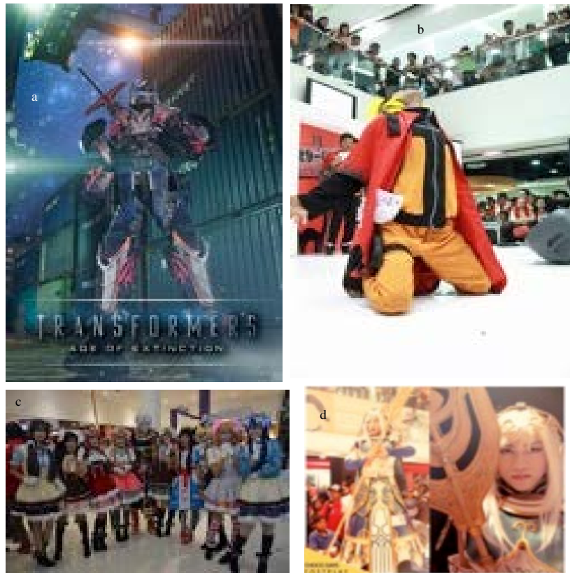
Fig. 3: Various cosplayer character and Choco Days' atmosphere in Tunjungan Plaza.