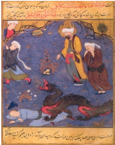
Fig. 4: Dragon in other nations

Dragon in other nations: “In fictions all over the world but China, where dragon is a peaceful creature, it is a symbol of filthy and foul forces. It stops water from spreading and wants to immerge sun and moon. Therefore, to save the world, he must be erased. This concept of dragon as a main source of devil force and an enemy maker is abundant in religions and literatures” (Fig. 4).