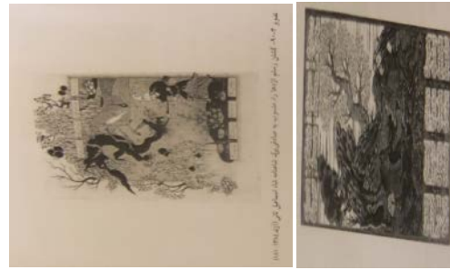
Fig. 5: Symbolic concepts of dragon

Symbolic expression of Iranian art concepts has helped to the expression and spreading of Iranian literature, poetry and mythology. Iranian concepts and mythology are absorbable in different miniature books and in carpets figures and symbolic concepts of Iranian carpets. Thus, two examples of symbolic concepts of dragon are given in Fig. 5.