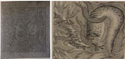
Fig. 7: Artistic works dragon in Iran

withhold his blessings and welfare from them. Then, they descended to earth with their two enemies satan and snake.