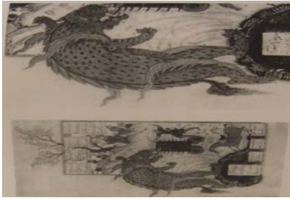
Fig. 6: Cultural work dragon in Iran