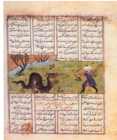
Fig. 3: Islamic mysticism dragon

Dragon in verses and stories: Since, dragon is the symbol of devil and evil, Quran also knows Satan with such characteristics. In Holly Quran, dragon has the titles of a snake. In Quran, it talks about the Adam and Eve story and their repulsion from heaven, it talks of two of their enemies. Tabari history narrates this story as “because