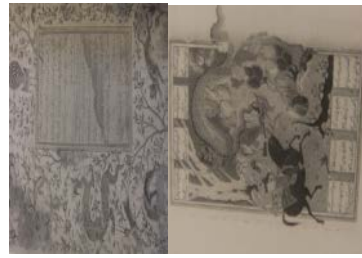
Fig. 8: Literary works dragon in Iran