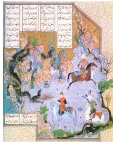
Fig. 1: Dragon in Avesta

Dragon in Avesta: Dragon is an Azhi which in Avesta comes with the word Dahak. Azhidahak is a combination of Azhi+Dahak, it means a biting dragon and a harmful one = Zahak. In Avesta, dragon is among devil creatures. After the creation of the first country by Ahouramazda which was Aria Vinch, Ahriman created a snake (dragon) which was a powered-pow creature and a harmful one. Then, Fereidoun killed it. A three-snout dragon, three-headed, six-eyed evil of lying, the most powerful lie which was made by devil and. In Avesta dragon was mentioned as a destructor and an eraser of the folk. “His name is among stupid-minded ones, it is a devil phenomenon. Azhi in Avesta and Ahi in Sanskrit mean snake mostly Azhi comes with the word “dahak” and their combination Azhidahak in Iranian mythology is Zahak. It is used as snake and dragon”. Azhidahak is a predatory devil and it is the most powerful creature