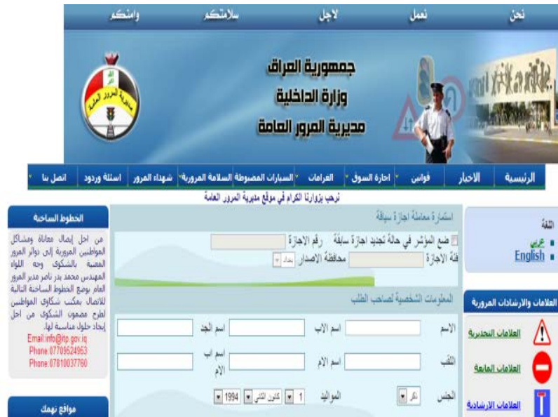
Fig. 4: E-form of driving test

e-Form: recently some of the Iraqi agencies have made online form to apply for a driving test (Alrahman, 2011). Agency of traffic police has provided website to full up form to apply driving test also there is option to check the car fine which has shown in Fig. 4.