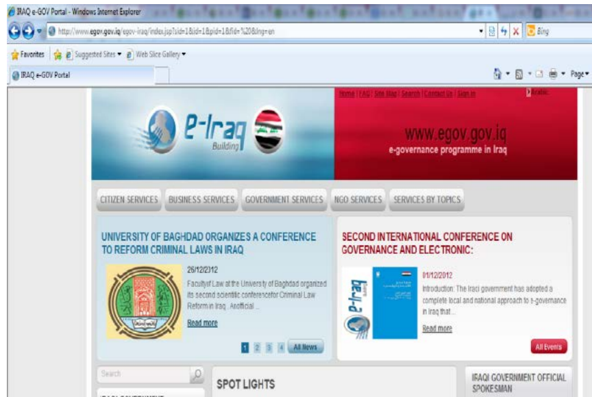
Fig. 1: Main page of Iraq e-Gove portal

E-health: Iraqi hospitals are going to adopt ICT to provide electronic services to their patients. Strategy and roadmap for Iraqi e-Health vision has formulated as follows.