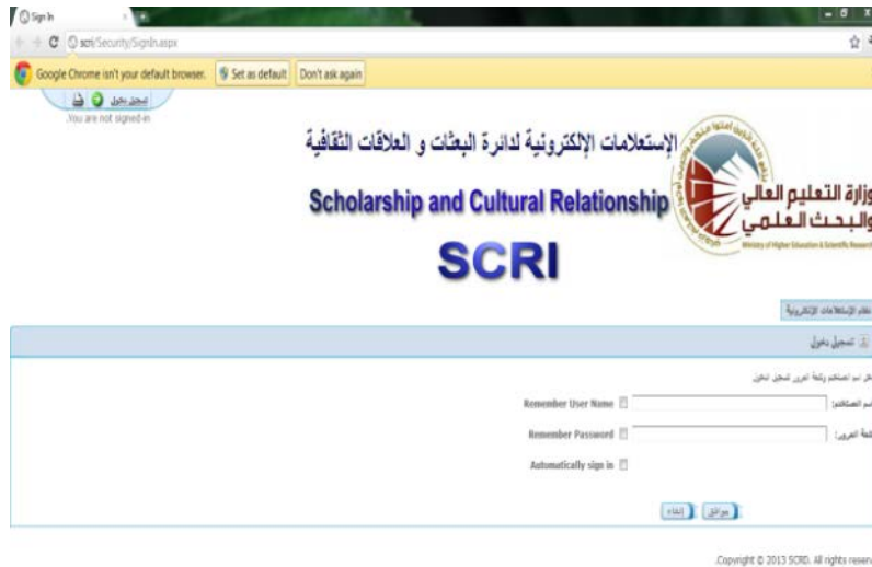
Fig. 5: Follow up system (Mohammad et al. , 2014)