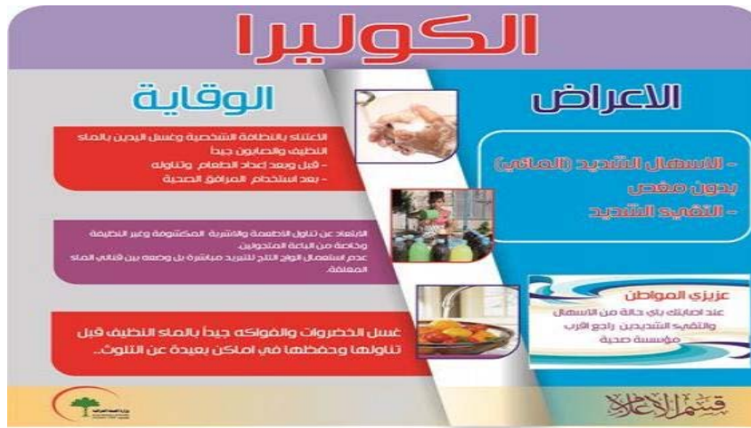
Fig. 7: Multimedia by ministry of health