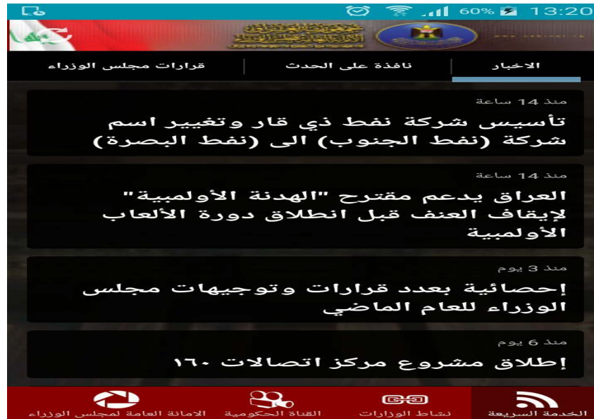
Fig. 8: Mobile app for Iraqi government

video and text. Iraqi government has been used multimedia in many sectors such as, Ministry of Municipals and Ministry of Health. Figure 7 examines the use of multimedia by Ministry of Health.