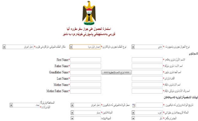
Fig. 3: E-passport record