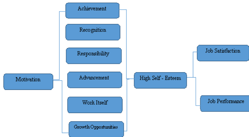
Fig. 2: Herzberg motivator factors and maslow self esteem leading to job satisfaction and performance

Motivation theories: This study will anchor on Herzberg’s Two-Factor theory as the main theory as well as Abraham Maslow (1943) hierarchy of needs. These two theories explain the effect of employees’ intrinsic motivation and its psychological outcome.