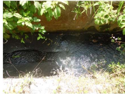
Fig. 2: Water sampling location at the upstream of the water body