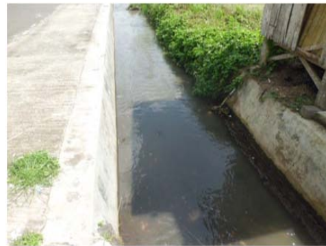
Fig. 3: Water sampling location at the middle stream of the water body

The community perception of the industrial wastewater resulted in as the followings: the industrial wastewater was harmful to the environment (66.7% of the respondents disagreed); the industrial wastewater was hardly manageable (80% of the respondents disagreed) the wastewater was safe (73.35% of the respondents agreed); the industrial waste water gave benefit to the