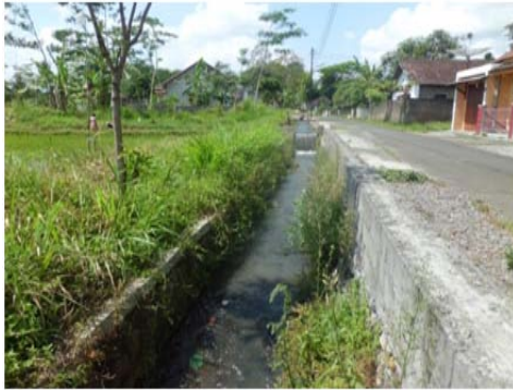
Fig. 4: Water sampling location at the downstream of the water body