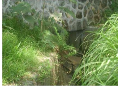
Fig. 1: Wastewater disposal from the industry to the environment