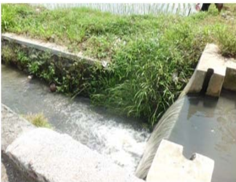
Fig. 5: Wastewater reuse for irrigation