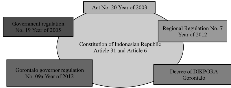
Fig. 1: Legal Basis of free education implementation in gorontalo