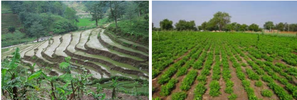
Fig. 3: Agricultural potency in Kecamatan Gunung Wungkal, Pati Regency (Anonymous, 2015)