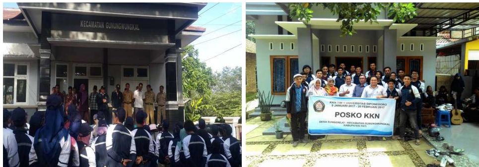
Fig. 1: UNDIP students doing KKN program in Kecamatan Gunung Wungkal, Kabupaten Pati (Anonymous, 2015)

Scheme Program can motivate and give useful advice to the communities in developing their areas. The students, furthermore, need to develop and improve their social skills, so, they can fluently interact with the people in the village where they stay and do the program.