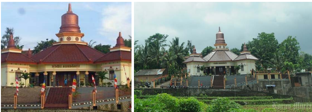
Fig. 5: Saddhagiri Monastery in Kecamatan Gunung Wungkal, Kabupaten Pati (Anonymous, 2015)

education, economy and praying facilities. One interesting thing about this population is its religion diversity. It can be seen from the various worship places like mosque, mushola, Church and Monastery. Worship place that attracts quite a lot of visitors is Saddhagiri Monastery in Jrahi Village. It looks majestic among environment that is still green with many plants as seen in Fig. 5.