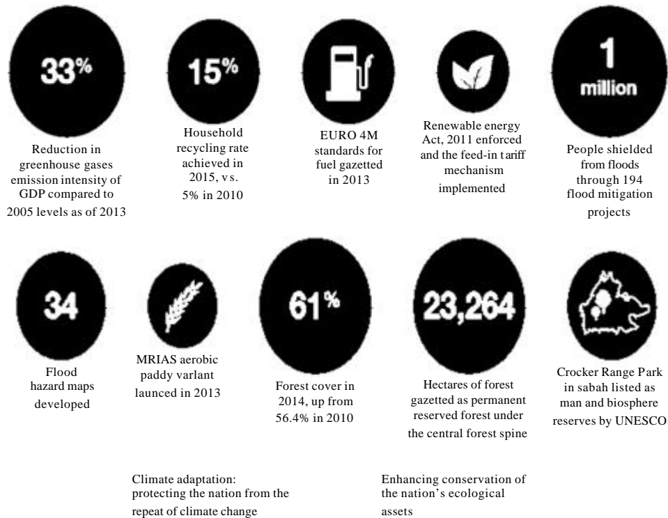
Fig. 2: Highlights 10th Malaysia Plan (2011-2015)-achieved