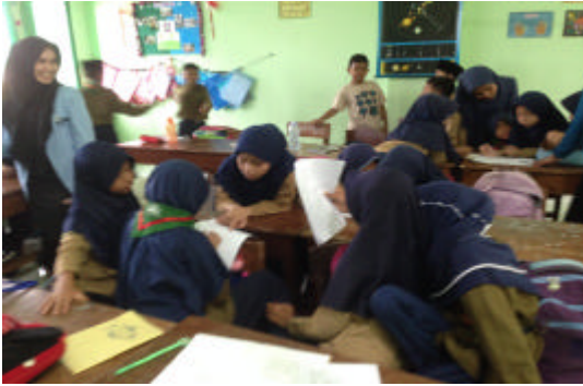
Fig. 2: The students are directed by the teacher in the preparation of English drama performance