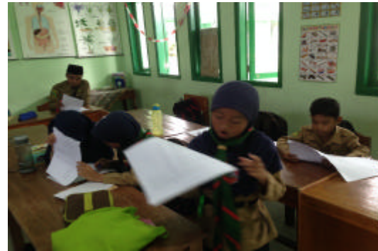
Fig. 3: The students are reciting the text with the supervision of the teacher

some difficulties because they do not have the educational background in theater study. In practice, the content of the drama activities was designed based on the teacher's curricula unit (Fig. 2).