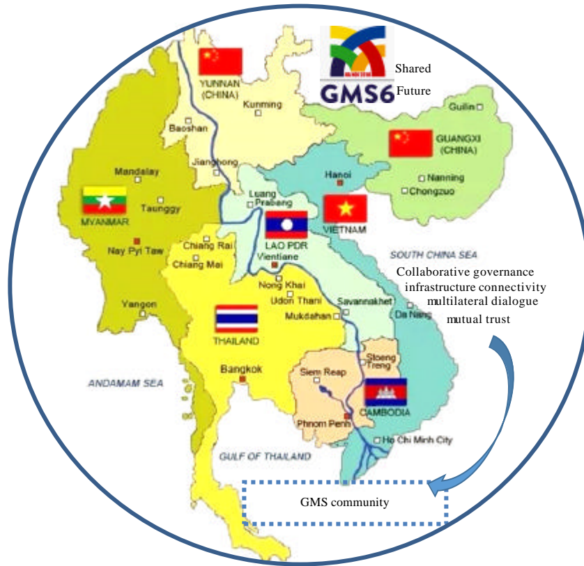
Fig. 2: Integrated GMS+CLMVT+YZ under BRI