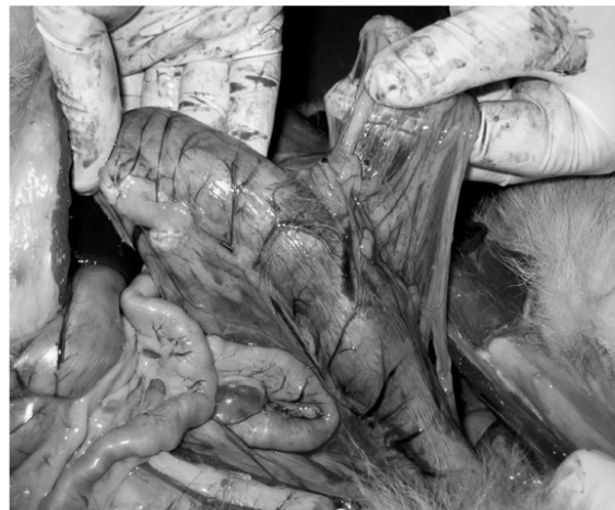
Fig. 2: Peritoneal adhesion formation in control group 3 weeks after surgical trauma (Grade 3)