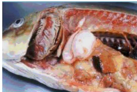
Fig. 3: Dissection of infected tissue with the typical signs as SVC with oedema of all internal organs as well as of the wall of swim-bladder and spleen has enlarged and marbled in appearance and general petechiae, mottling form on bronchi (gills)

The results of this study indicated that the SVC infection can be found in some farms of rainbow trout breeding in Iran. For the study of pathogenicity and isolation of SVC virus and the determination of the severity of disease, the establishment of laboratory with virus culture equipment is necessary. The severity of disease was dependant to the prodromal period of disease, body immunological