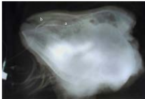
Fig. 1: Lateral contrast media radiographic views. (a) Middle portion of lacrimal duct (b) Distal opening of lacrimal duct