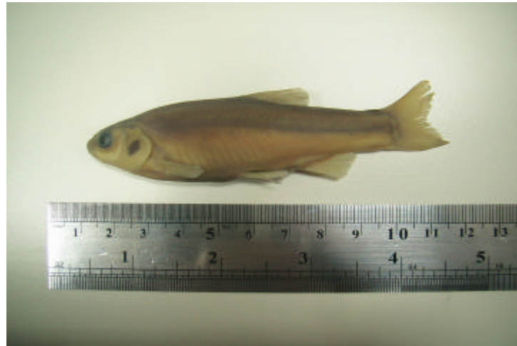
Fig. 1: Pseudophoxinus anatolicus from Anatolia