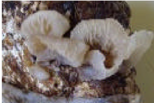
Fig. 2: High quality wood ears fruiting on maizecobs supplemented with wheat bran

quality ranging from a score of 2-4 (Table 3). The appearance of the mushrooms was excellent, with well-formed large caps and conspicuous stems (Fig. 2). Grass straw gave the lowest quality mushrooms followed by sugar baggasse. Wheat straw and wheat bran combination also gave good quality fruit bodies that ranged from 2-3 (Table 3). Supplemented wheat straw and sugarcane bagasse produced fruit bodies of average quality since their characters were intermediary in terms of shape, size and texture. The lowest quality fruit bodies were obtained from grass straw especially when supplemented with rice bran (Table 3).