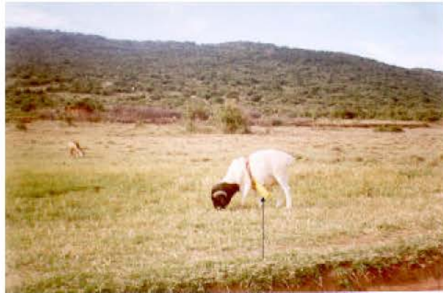
Fig. 2: Sheep (Arrow indicating mating control device)

As far as helminthes control is concerned, farmers spent up to Ksh.2500 (US. $31) monthly. However, a key informant informed the research team that deworming small ruminants was not regularly done (done twice a year using dewormers of choice). Instead, farmers depended on natural salt licks, which they believed helped in worm control.