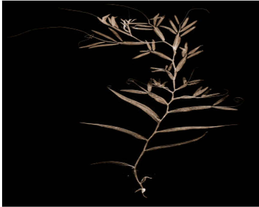
Fig. 2: Plant of 'Fava Santorinis' ( Lathyrus clymenum ) a landrace with historical origin cultivated under traditional farming system in Santorini island

2009), with the selection based on single plant performance. All experiments were subjected to the sustainable system of cultivation (field rotation, hand weeding, no irrigation and without application of fertilizers and agrochemicals). Improvement of grain yield relied on direct pedigree selection, accomplished by analytical selection for the number of pods per plant, plant leaf color and plant vigor