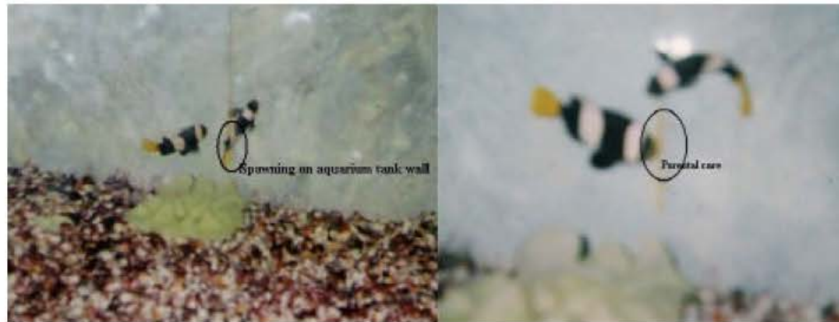
Fig. 2: The spawning and parental care of clown fish A. sebae in Marine Research aquarium

Miyake-jima and Shiko-ku Island spawned 7.0 and 5.5 times per year, respectively (Bell, 1976; Ochi, 1985, 1989), while A. clarkii in captivity spawned 34.6 times per year (Hoff, 1996). There is no particular spawning data in natural and captive environment of A. sebae (Fig. 2).