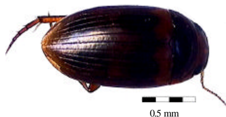
Fig. 6: Lacconeatus sp. 1 (2.069 mm)