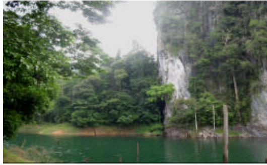
Fig. 3: The first sampling site was at Teluk Bewah along a rugged terrain of 1.5 M trail which ends with a limestone wall