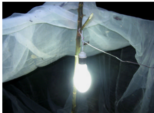
Fig. 5: Light trapping with mosquito net