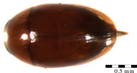
Fig. 7: Hydroratus sp. (1.73 mm)