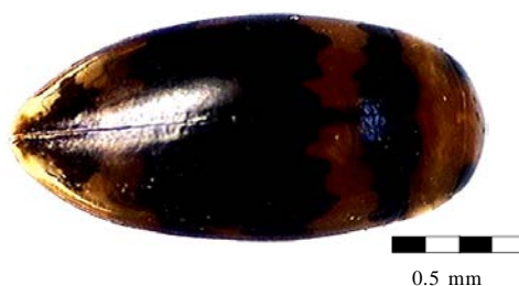
Fig. 8: Unidentified sp. (2.432 mm)

Hydrophilidae and one species from family Dytiscidae were caught by sweep net at Sungai Cicir (Fig. 8).