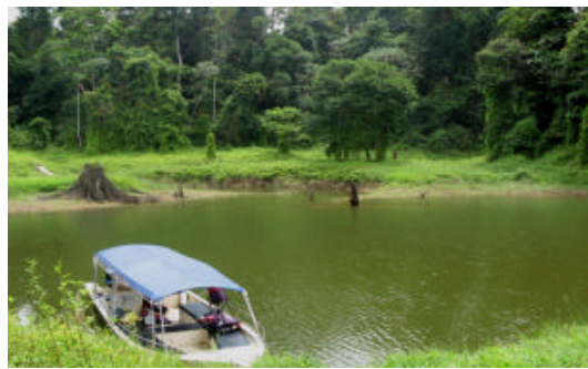
Fig. 4: The second sampling site was at Sungai Cicir about 2 h boat ride from Teluk Bewah