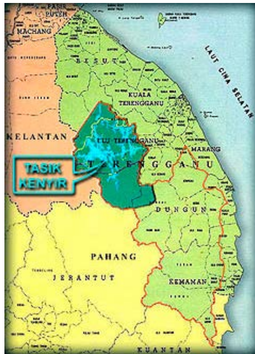
Fig. 1: Kenyir lake, Terengganu, Malaysia

Figure 1 shows the location of Kenyir lake within Terengganu state, Malaysia. Figure 2 shows the location of Teluk Bewah and Sungai Cicir at Kenyir Lake.