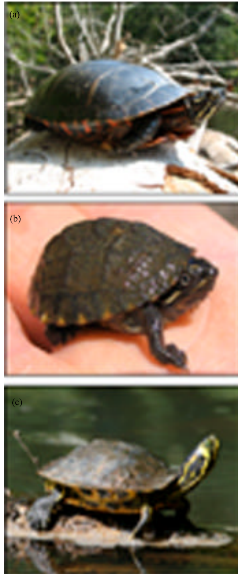
Fig. 1: Photos of turtle species examined in this study. (a) painted turtle ( Chrysemys picta ), (b) juvenile musk turtle ( Sternotherus odoratus ) and (c) yellow-bellied slider ( Trachemys scripta ).

parasites were counted, following descriptions given in Telford (2009). At this magnification, fields of view had an average of 80 ( \pm 13 SD) erythrocytes (Davis, unpubl. data ), so this was equivalent to examining ~8000 cells per turtle. With this value, the number of cells affected by Haemogregarine gametocytes was transformed into a percentage (of erythrocytes) for comparison with other published reports.