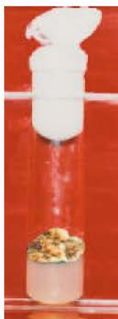
Fig. 3: Embryogenic callus formation from floral bud explant of banana on MS+2.0 mg L -1 BA+2.0 mg L -1 Kn+2.0 mg L -1 IAA+15% CW