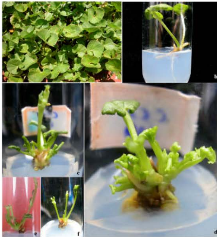
Fig. 1: (a-f) Shoot multiplication studies in Centella asiatica . a: Mother plant, (b) Culture initiation in MS basal medium, (c) Multiple shoots formed in MS media supplement with 0.5 \text{ mg L}^{-1} BA, (d) Multiple shoots formed in MS media supplement with 0.1 \text{ mg L}^{-1} BA, (e) Multiple shoots formed in MS media supplement with 0.5 \text{ mg L}^{-1} BA and 0.5 \text{ mg L}^{-1} IAA and (f) Multiple shoots formed in MS media supplement with 0.5 \text{ mg L}^{-1} BA and 0.5 \text{ mg L}^{-1} NAA

The nodal explants of Centella asiatica cultures were successfully established in full strength MS basal medium (Fig. 1b). Only 80% of the cultures could be established and major loss was due to fungal contamination. Emergence of two to three leaves was noticed per culture within 10 days in this hormone free medium. But the cultures did not show any shoot induction response in MS growth regulator free medium. Similar results were reported in the same species (George et al. , 2004) and also in other medicinal plants (Patnaik and Debata, 1996; Sahoo and Chand, 1998; Usha et al. , 2007). In the present study growth regulator free medium was used to reveal the contamination in culture initiation stage and their elimination. The use of simple salt plus sucrose medium is adopted as a usual method in culture initiation in many laboratories for reducing the cost on contamination (George, 1993).