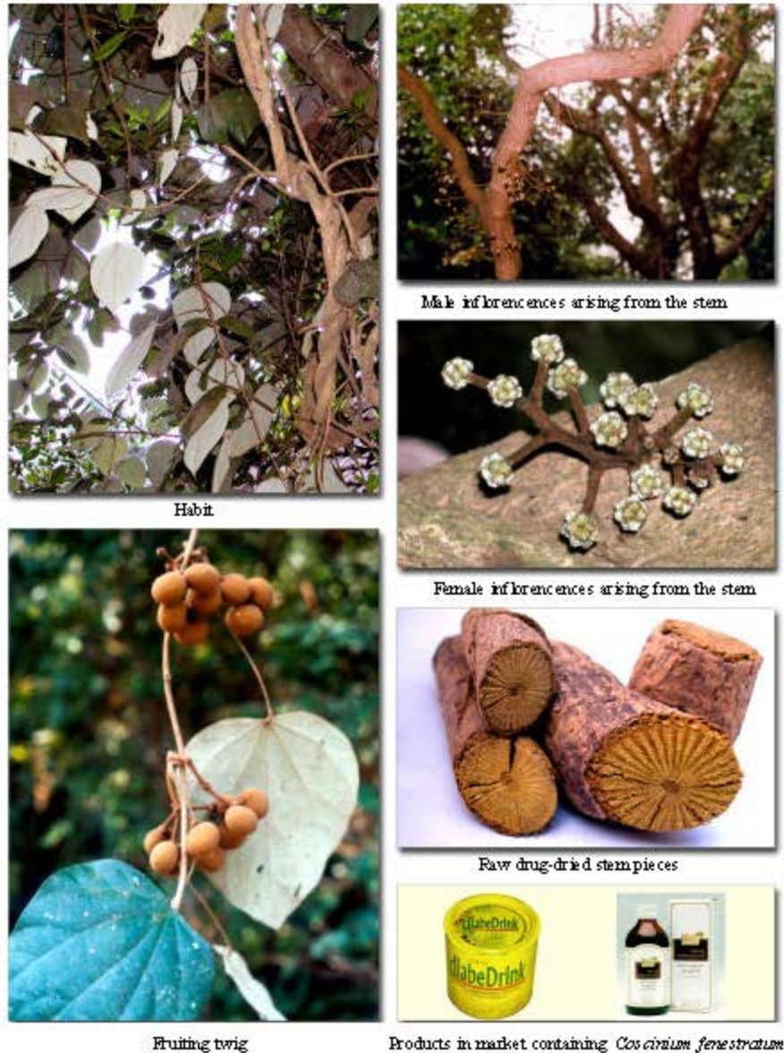
Fig. 1: Photographs of Coscinium fenestratum (Gaertn.) Colebr

Regional: States of Kerala, Karnataka and Tamil Nadu ( http://www.filht-india.org ). In Kerala, it occurs in Thiruvananthapuram, Thissur, Malappuram, Palakkad, Kollam, Idukki, Wayanad (Nambiar et al. , 2000), Kannur (Udayan et al. , 2004) and Kozhikode districts.