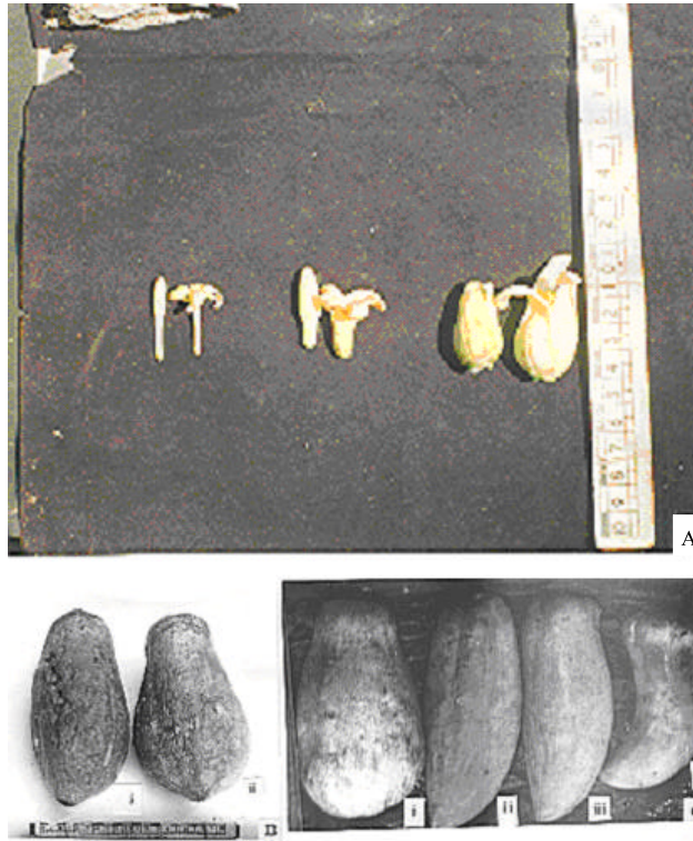
Fig. 3A: Variations in the flower of Carica papaya plant forms (flower bud on the left and open flower on the right for each sex)