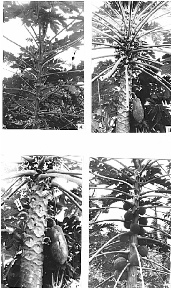
Fig. 2: Plant forms in Carica papaya :