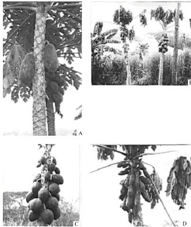
Fig. 4: Plant Forms in Carica papaya