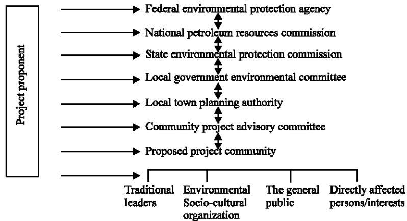
Fig. 1: Proposed channels of communications/interaction for the EAI/SIA process in Nigeria,s petroleum industry

Source: Modified after Olokesusi, Towards an International Framework for Environment Impact Assessment Nigeria, Individual Research Report No. 6, NISER, Ibadan, Nigeria