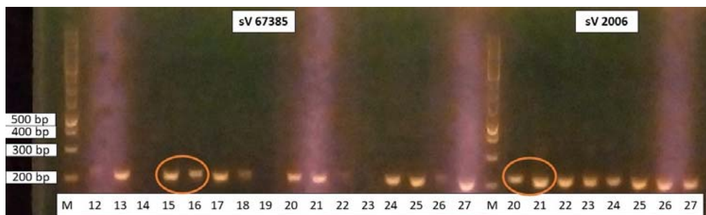
Fig. 1: Visualization of PCR primer products sV67385 and sV2006 on 1.5% agarose gel visible polymorphic bands are circled