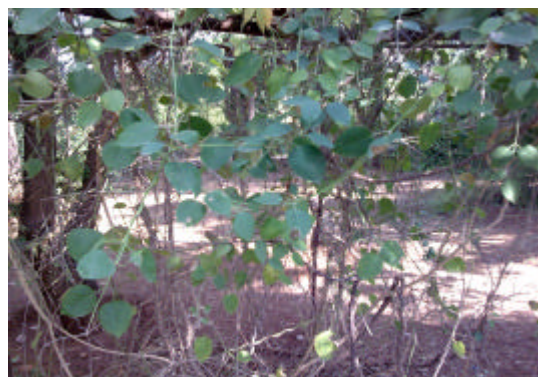
Fig. 1: Aerial part of Leptadenia reticulata

Leptadenia reticulata Wight and Am. is a much branched twining shrub of family Asclepiadaceae. Flowers are greenish yellow, in many flowered cymes (in lateral or subaxillary cymes), the follicles are sub woody and turgid. Stem is cylindrical and bent occasionally at places. It is 5 to 10 cm long, 0.5 to 2.5 cm in diameter. The surface is rough, longitudinally ridged, wrinkled and furrowed, transversely cracked and with vertically elongated lenticels at places. Externally whitish brown, internally pale brown, fracture short and splintery, odor and taste are not characteristics. The bark is yellowish brown, corky, deeply cracked. Leaves are ovate to cordate, 4 to 7.5 cm long, 2 to 5 cm broad, entire, acute,