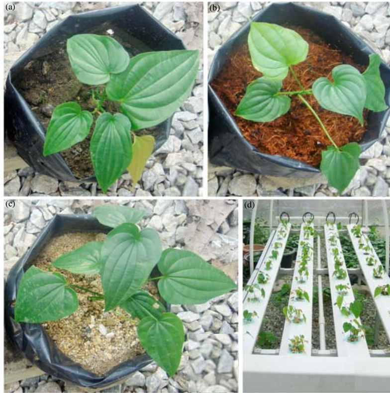
Fig. 2(a-d): Stemona plantlets cultivated in (a) Soil, (b) Coconut fiber, (c) Sand and (d) Hydroponic culture