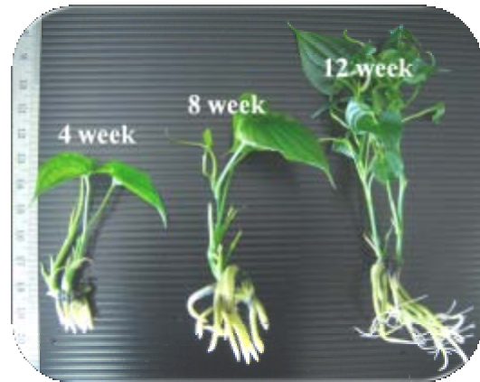
Fig. 1: S. curtisii plantlets at different ages

The optimal age of S. curtisii plantlets for acclimatization: In order to increase the survival rate of S. curtisii plantlets, the effect of plantlets age was examined. S. curtisii plantlets from in vitro cultures of 4, 8 and 12 weeks-old (Fig. 1) were washed with running tap water to remove agar on the roots and soaked with 0.2% solution of fungicide (Carbendazim) for 30 min. Twenty plantlets in each age group were transplanted individually into plastic grow bag (4 inch width×8 inch length) containing soil. The plantlets in each experiment were grown in the greenhouse at a temperature range 25-30°C and 11-13 h photoperiod. The plantlets were irrigated two times per day in morning and evening. The survival rate of the plantlets from each age group was recorded every 2 weeks for 8 weeks. Plantlets survival is defined as the plantlets which are still alive.