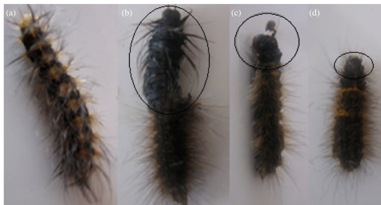
Fig. 1: Molting deformities in Ivth instar larvae of Pericallia ricini treated with Plumbagin (Topical treatment) (a) Control, (b) 50, (c) 75 and (d) 100 mg

Larval-pupal intermediate stages were also observed in the fifth instar larvae treated with 100, 35 and 25 mg mL -1 concentrations of plumbagin. Pupal case was formed normally but exhibited serious disturbances during pupal formation. The larva has failed to complete its development and they were unable to emerge into normal