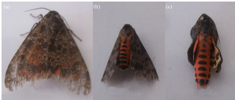
Fig. 3(a-c): Effect of Plumbagin (Topical application) on adult of Pericallia ricini (a) Control, (b) 10 and (c) 20 mg mL -1

pupa. The larva died within the pupal case. Imperfect metamorphosis was observed (Fig. 2). Abdel Fattah A. Khalaf et al. (2009) observed that larval-pupal intermediates in the larvae of Synthesiomyia nudiseta treated with botanical volatile oils. This may be due to an imbalance in the hormone titers at critical times of moulting. This view was supported by Retnakaran et al. (1985). Similar observation was reported by Martinez and Van Embden (2001) in Spodoptera littoralis [Boisduval] treated with azadirachtin. Gandhi et al. (2010) reported that the extracts of plants like Annona squamosa [L.], Lantana camara , Cleodendrum inerme , Cassia fistula , Azadirachta indica and Calotrophis procera interfere with moulting process.