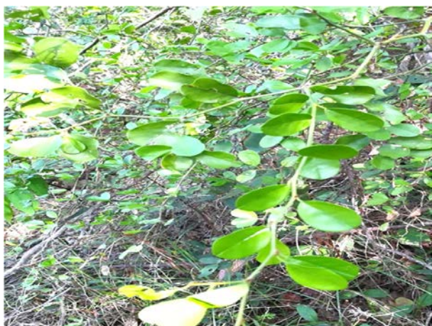
Fig. 1: Capparis sepiaria L.

vacuum evaporator (BÜCHI Labortechnik AG, Switzerland). Each crude extract was mixed with Dimethyl sulfoxide (DMSO, Sigma) to the final concentration at 50 mg mL -1 before used. Screening of antibacterial activity of Capparis sepiaria extracts: Six pathogenic bacteria ( S. aureus TISTR 1466, S. epidermidis TISTR 518, B. subtilis TISTR 008, P. aeruginosa TISTR 2370, E. coli TISTR 780 and K. pneumoniae TISTR 1383) were cultured with shaking at 37°C using Nutrient Broth (NB) for 18 hrs and the bacterial concentration was adjusted at OD 600 to 0.1 using a spectrophotometer. The disc diffusion method was used to screen the antibacterial activity of plant extracts and grinded fresh fruits. For plant extracts, 100 mL of each pathogenic bacteria were spread on NA and the sterile filter paper disc with a diameter of 6.0 mm was placed onto agar. Twenty micro liters of each plant extract were loaded onto sterile filter paper disc. The DMSO and kanamycin were used as control. For grinded fresh fruit, the ground fresh fruits were transferred using aseptic technique onto agar medium containing pathogens 16 . Plate was incubated at 37°C for 24 hrs in bacterial incubator (JSR, Korea). The presence of inhibition zone was recorded and considered as indication for an antibacterial activity.