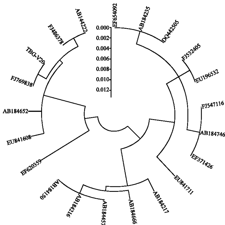
Fig. 3: Phylogenetic tree is based on the nucleotide sequence of 16S rRNA genes. The Neighbor-Joining algorithm tree was constructed by MEGA 4.1

the observed degree of similarity could have arisen by chance: E is the number of sequences that would be expected to match as well or better than the one being considered, if the same database were probed with random sequences. Values of E below about 0.05 would be considered significant; at least they might be worth considering (Arthur, 2005). According to Michael and Sharon (2007) and Arthur (2005) reports, in this study, isolate TBG-V20 (557 bp) had (100%) ideal >99.5% similarity and E value (0.0) <0.05 with S. noboritoensis , S. phaeochromogenes and S. melanogenes . On the basis of BLASTN search and phenotypic results TBG-V20 was identified as a strain of S. noboritoensis .