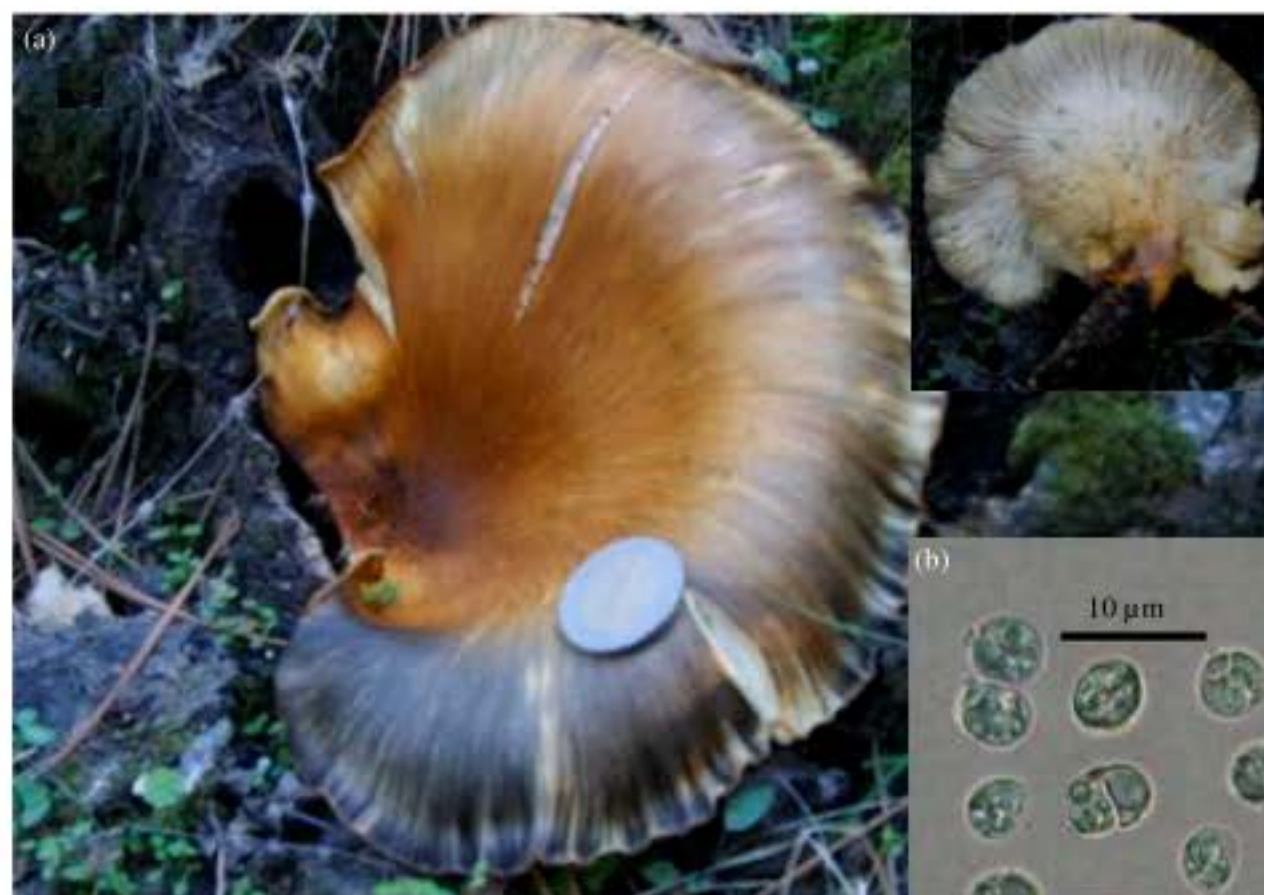
Fig. 2: Omphalotus olivascens var. olivascens : (a) Basidiocarp and (b) Basidiospores

38. Strobilurus tenacellus (Pers.) Singer