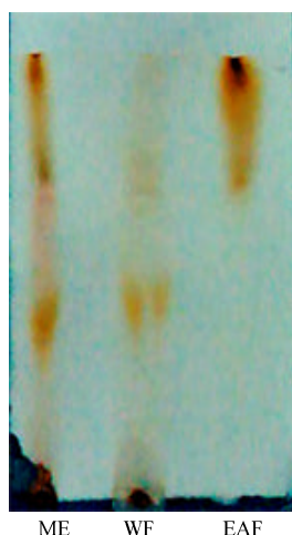
Fig. 1: Thin layer chromatogram of fractions separated from fruit rinds of G. indica

Hyaluronidase inhibition: Methanolic extract at low concentrations, i.e., 250 \mu\text{g mL}^{-1} failed to produce noticeable hyaluronidase inhibition. Concentrations in the range of 500 to 750 \mu\text{g mL}^{-1} produced significant inhibition (Table 1). At 750 \mu\text{g mL}^{-1} it was 94% and then