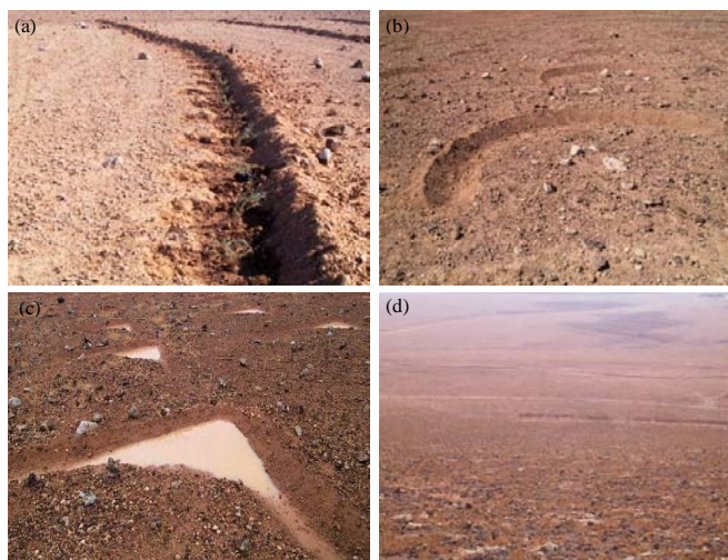
Fig. 1(a-d): (a) Photograph showing contour furrows, (b) crescent-shaped, (c) V-shaped, (d) micro-catchments established for water harvesting at Tal Rimah experimental site

trapezoidal bunds and small runoff basins (Oweis and Hachum, 2004). Boers (1994) as cited by Ali and Yazar, (2007), mentioned that after transplantation, rainwater harvesting can be used to speed up shrub establishment and deep root development and to reduce the mortality rate.