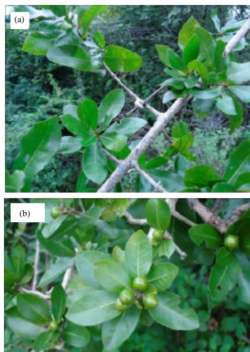
Fig. 1(a-b): The plant used in the study- H. mystax L. showing (a) vegetative twig with hooks and (b) a fruiting branch

Preparation of test solutions: For cytotoxicity studies, each weighed Methanolic Leaf (MLE) and stem bark (MBE) extracts were separately dissolved in distilled