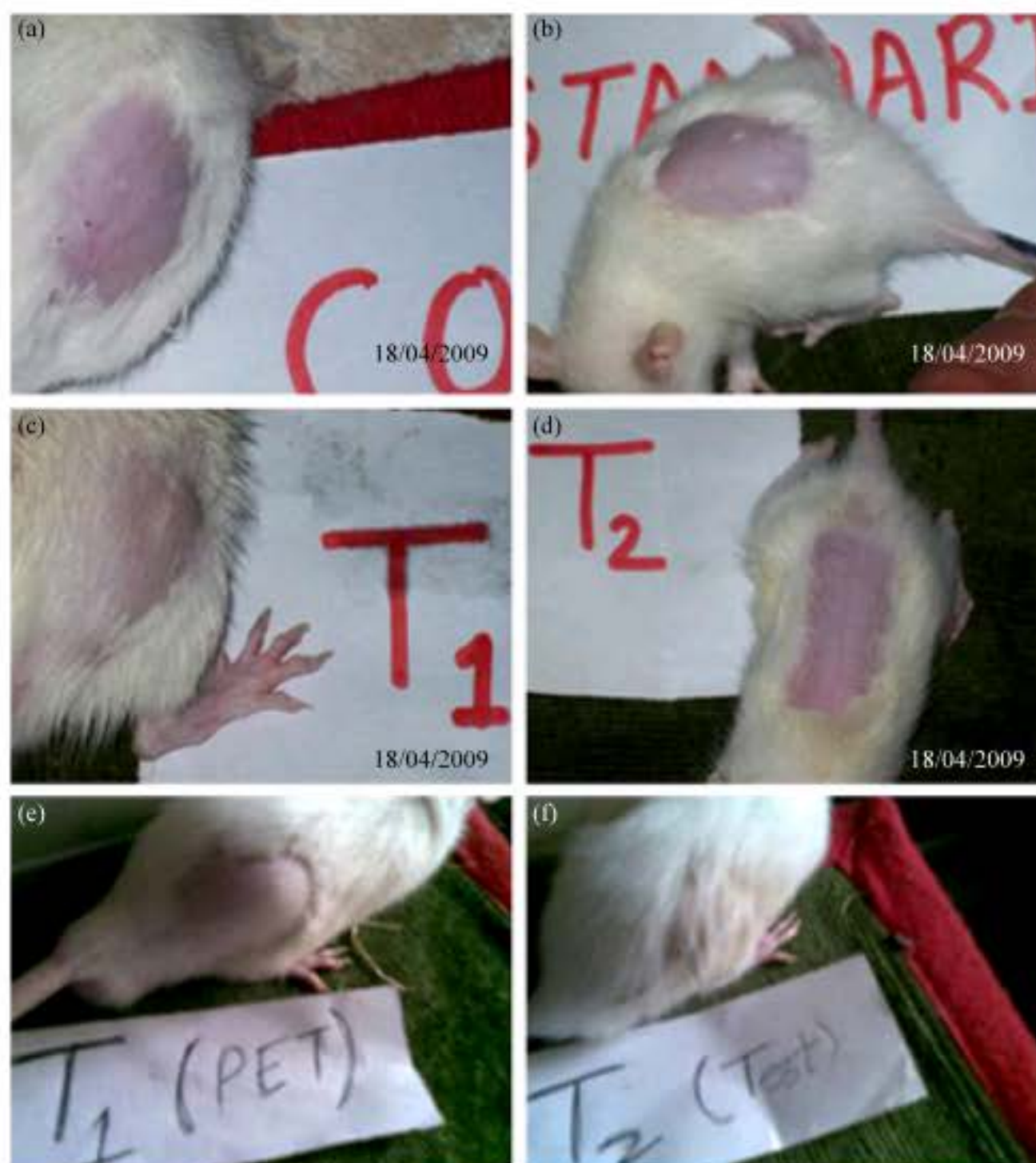
Fig. 2: In vivo hair growth study showing hair growth initiation day photographs of rats treated with formulation prepared from ethanolic extract and petroleum ether extract of Trigonella (a) Control (6th day), (b) Standard (6th day), (c) T 12 (6th day), (d) T 21 (6th day), (e) T 1 (5th day) and (f) T 2 (6th day)