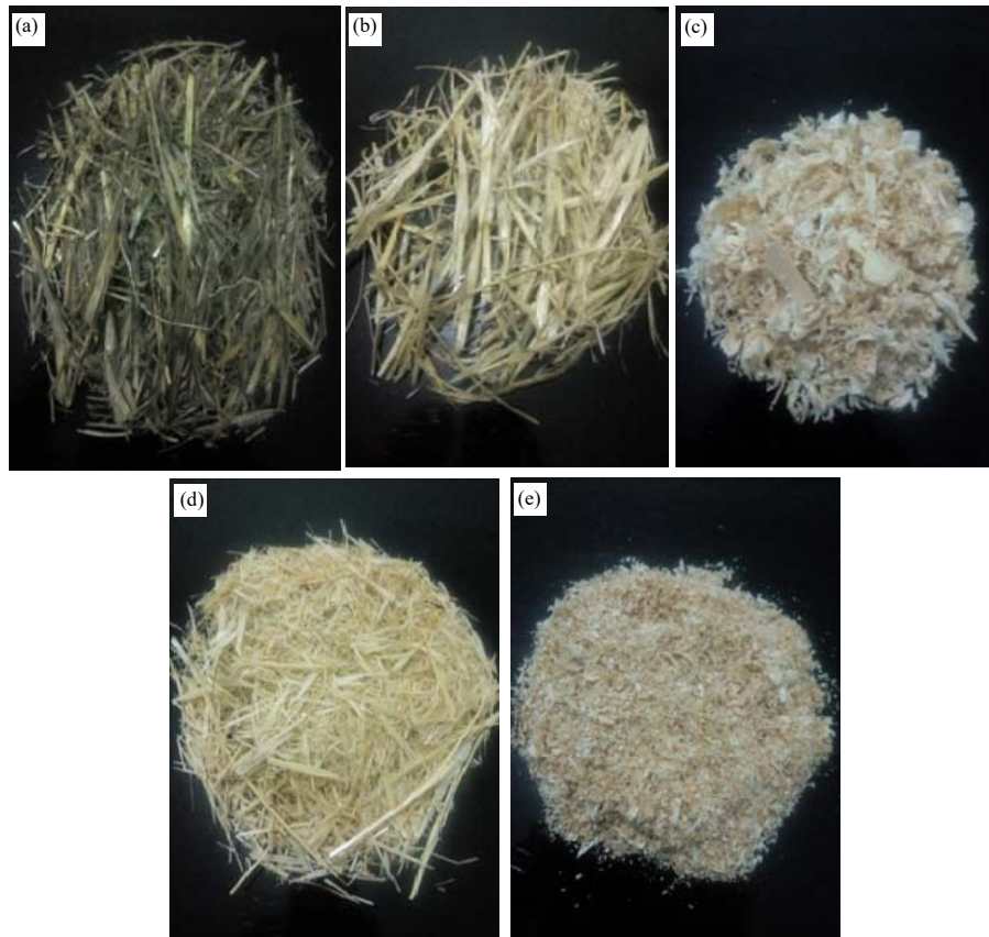
Fig. 1(a-e):Types of litter used in trial; (a) Low quality straw (LQS), (b) Standard quality straw (SQS), (c) Wood shaving (WS), (d) Crop residues (CR) and (e) Sawdust

Design and husbandry: Six hundred one-day-old male broiler chicks (Cobb 700) were randomly allocated to five treatments with 6 replicates pens of 20 birds (10 birds/m 2 ). The treatments were consisted of five different bedding types (Fig. 1): wood shaving (WS), sawdust (S), standard quality straw (SQS), low quality straw (LQS) and crop residues (CR). All types of litters were to a depth of approximately 5 cm. Each pen measured 2 m 2 and was equipped with feeders and nipple drinkers. Feed and water were available ad libitum. Broilers were reared to 42 days of age on a 3 phase commercial feeding program