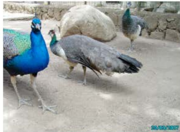
Fig. 3: Peacocks and peahen.

From one hundred and sixty three wild and captive birds