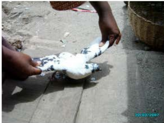
Fig. 5: Pegeon

The presence of mild strains of the virus in localities could be responsible for the variability in the responses of village poultry to sporadic outbreaks of ND in the country. It could also be responsible for vaccine failures commonly observed in commercial flocks (Ugochuckwu, 1982; Nawathe, 1985). The village chickens which outnumber commercial poultry by 8 to 1 in Nigeria are frequently seen roaming side by side with wild birds scavenging for food in the localities (Adene, 2004). Most workers in commercial poultry farms seem to hail from households where free-range chickens are kept. There is therefore a direct linkage between wild birds and the village poultry on the one hand and between village poultry and the commercial farms via the personnel on the other.