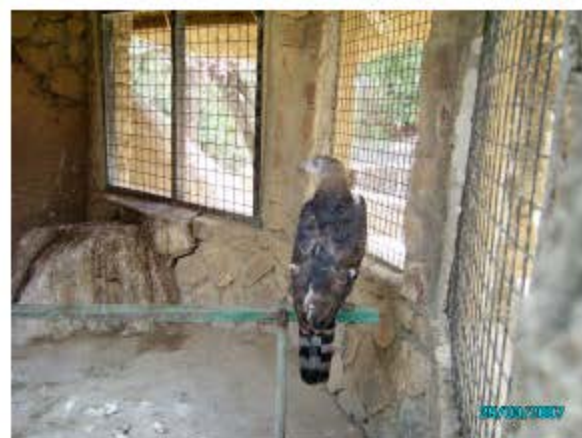
Fig. 4: River eagle.

The thirteen ND viruses were isolated from nine species of birds belonging to three different orders. Newcastle disease virus is widely known to maintain a broad host