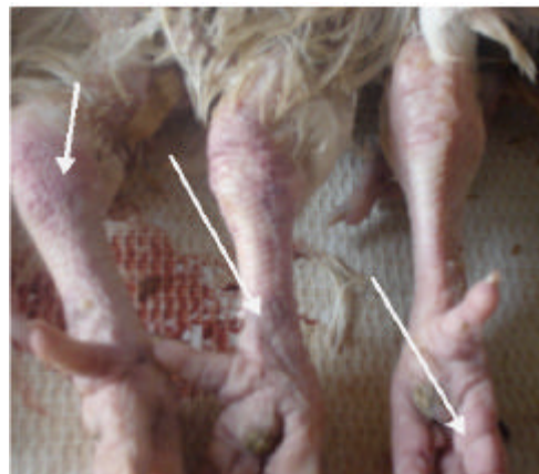
Plate II: Subcutaneous haemorrhages on the legs and shanks of Newcastle Disease infected 6 week-old broilers