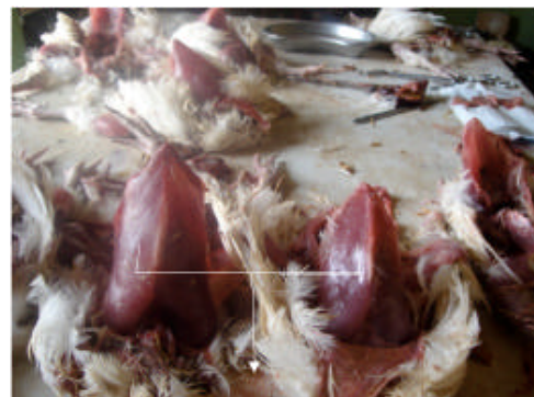
Plate III: Severe congestion of the pectoral muscles of ND infected 3 and 6 week-old broilers (arrow)

Gombe state AI Desk Officer was contacted and 4 live birds were taken to NVRI, Vom for further laboratory investigation.