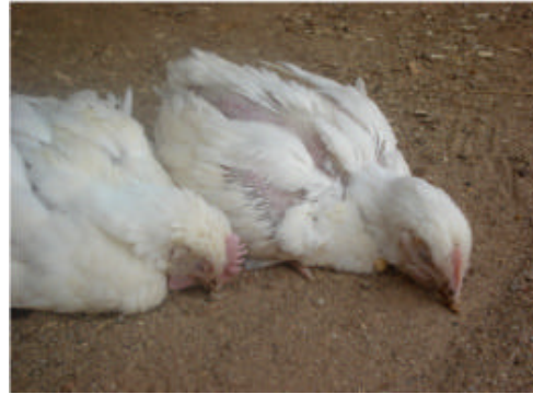
Plate I: Severely depressed 3 and 6 week-old broilers showing slight cyanosis of the combs and wattles, prostration, somnolence and dropped beak on the ground

Rapid field and laboratory diagnosis: Ten cloacal samples of both dead and live birds from the two flocks were tested according to the manufacturers guide line using ND and AI antigen detection test kits manufactured by Animal Genetics Inc. South Korea. Haemagglutination inhibition test was conducted on sera collected from the live but diseased birds. The