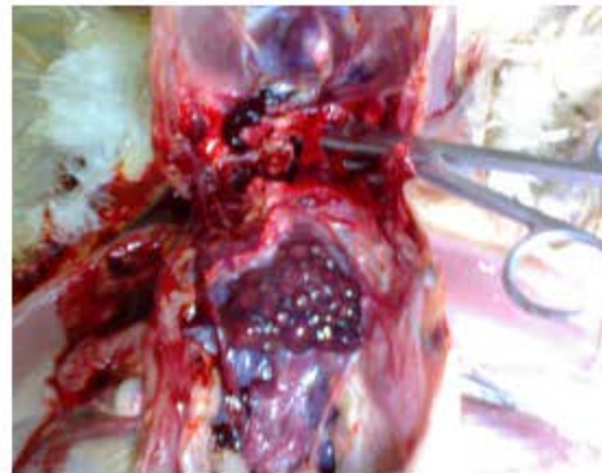
Pic. 1: Inspissated ovary and misshapen follicles in a bird that autopsied in second weeks post infection

*Daily percentage of egg production/number of hens