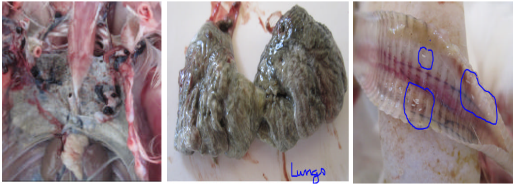
Fig. 2: Lesions in lungs (left and medium pictures) and eggs in trachea (right picture) of Syngamus trachei , a respiratory parasite tract observed in growing indigenous Senegal chickens fed the control diet