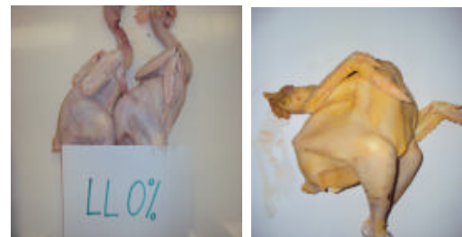
Fig. 3: Normal color (left picture) and intense yellow color (right picture) of skin of carcasses from growing indigenous Senegal chickens fed diets containing respectively 0% (LL 0 ) and 21% (LL 21 ) of Leuceana leucocephala leaves meal

This increasing of organs weight was not proportional to the live body weight of chickens, the ratio [organs weight/LBW] was significantly increased (p<0.05) with the leaves meal inclusion compared to the control. Moreover, the incorporation of Leuceana leaves meal in the diets had produced significantly and proportionally yellow coloration of the skin (Fig. 3) and abdominal fat (Fig. 4) of carcasses in traditional chickens compared to the control treatment. As for economic results, the price per kilogram of feed had increased with the level of Leuceana leaves meal inclusion. It was evaluated at 176, 182, 185 and 188 FCFA/kg respectively for LL 0 , LL 7 , LL 14 and LL 21 diets. The feed cost per kg carcass obtained was significantly lower in birds receiving LL 7 diet than those of other treatment groups. Birds fed the