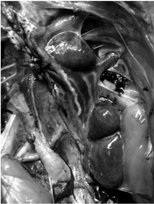
Fig. 2: Photo of a 64 week old male broiler breeder male with urolithiasis. Note the hypertrophy of the left kidney to compensate for the regression of the right kidney do to blockage of the ureter caused by a Uroliths

the kidneys were examined for grossly visible urolithiasis. The kidneys then were removed and weighed to the nearest 0.01 gram. The right and left kidneys were recorded separately so that the weights could be compared to determine symmetry.