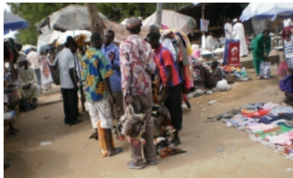
Fig. 3: Peddlers at the market of Dembé in the 5th district of N'Djamena (Chad)

The packaging used for poultry transportation was mainly made of single cages (73%), both cages and