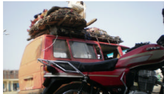
Fig. 2: Cage containing chickens on a minibush (bush taxi) at the Champ-de-fils market in N'Djamena, coming from Massakory (Chad)

***Itinerant Salesmen who get their supplies from Dembé market in N'Djamena in order to sell them at other markets in the city