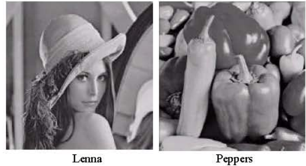
Fig. 3: Real test images

Table 2 summarized all ants setting used in our experimentations for all test images. Theses setting were selected because they gave good results in preliminary tests.