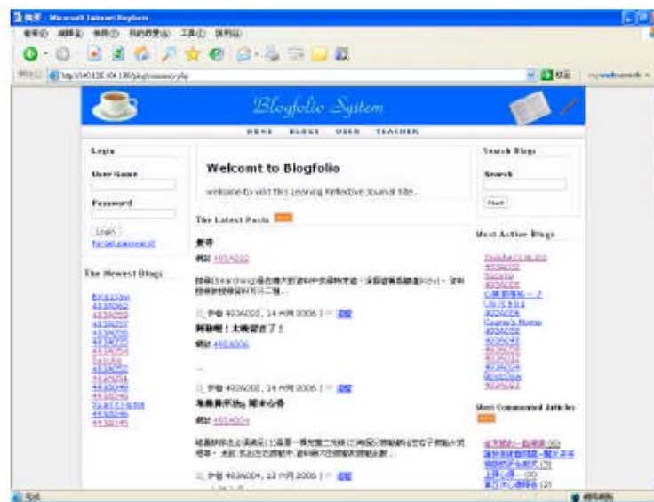
Fig. 4: A sample screenshot of system usage