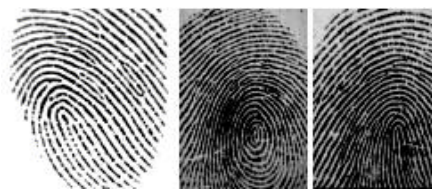
Fig. 3: Partial fingerprints taken from FVC2002

70% and above. This shows that partial fingerprints of size 75% and above have improved the classification rate in our approach. Table 2 show the actual differences in terms of FAR, FRR with TER. Second column and the third column indicate the number of pixels in the fingerprints. The TER rate for Jea and Govindaraju has been compared with 40, 50, 60, 70, 80 and 90%, respectively.