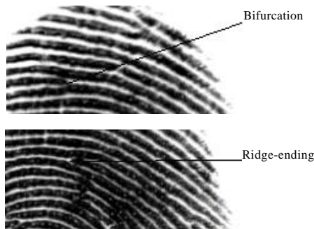
Fig. 1: Ridge bifurcations and ridge endings

Matching two fingerprints (in minutiae-based representation) is to find the alignment and correspondences between minutiae on both prints (Jea and Govindaraju, 2005). In order to obtain a good efficiency of matching process, strong enhancement algorithms has to be done during the pre-processing stage and good realization of minutiae extraction methods has to carried out. There are two major types of features that are used in fingerprint matching: local and global features. Local features, such as the minutiae information contains the information that is in a local area only and invariant with respect to global transformation. Global features, such as number, type and position of singularities, spatial relationship and geometrical attributes of ridge lines, size and shape of the fingerings, are characterized by the attributes that capture the global spatial relationships of a fingerprint (Jea and Govindaraju, 2005). In this study, we used local and global features followed by machine learning classifier to tune the result. Back-propagation algorithm is used to extract the minutiae points. SVM is used for optimum classification by removing the false pairs and considering only true pairs. Jea and Govindaraju (2005) claimed that partial fingerprint matching requires a set of local features and localized features have the ability to tolerate more distortions. Vajna (2000) has shows that the geometric deformations on local areas can be more easily controlled than global