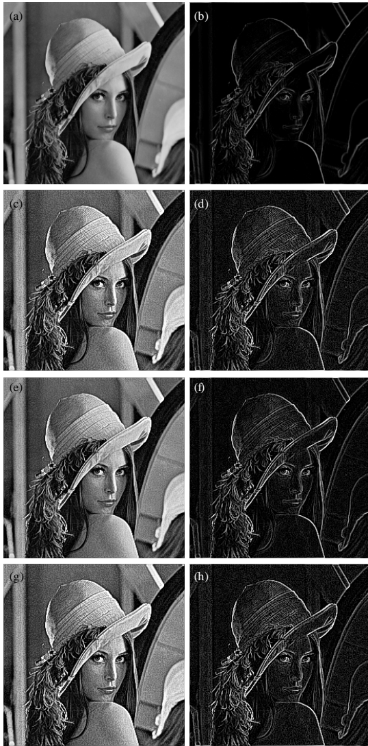
Fig. 2(a-d): Results with experimental image: (a) Original image, (b) Original image edge detection, (c) Traditional contrast enhancement, (d) Traditional contrast-enhanced edge detection, (e) New algorithm (t = 4), (f) New algorithm edge detection (t = 4), (g) New algorithm (t = 5) and (h) New algorithm edge detection (t = 5)