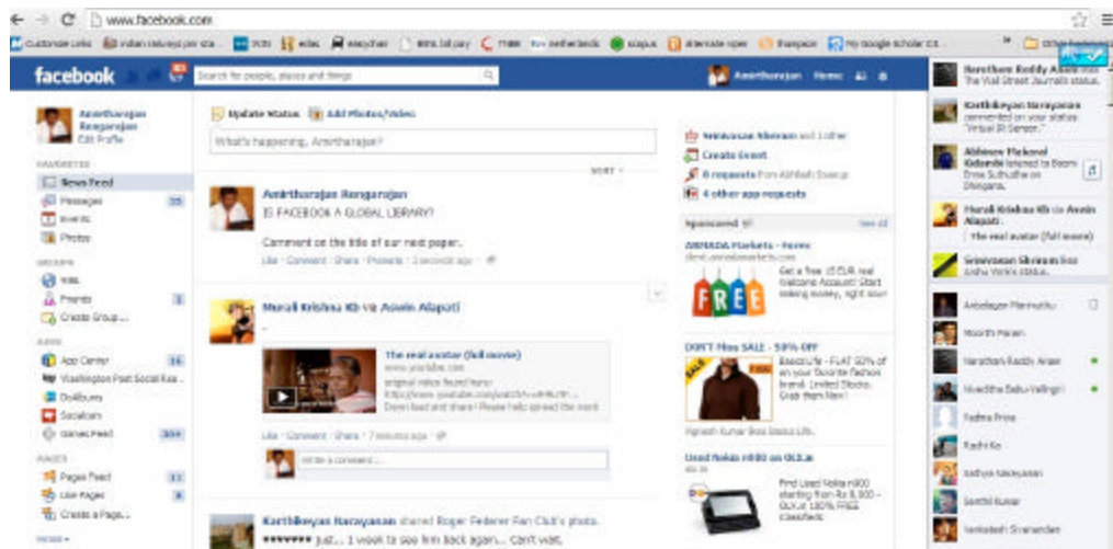
Fig. 2: Networking made easy

A survey, via a questionnaire was conducted on about two hundred and fifty students of SASTRA