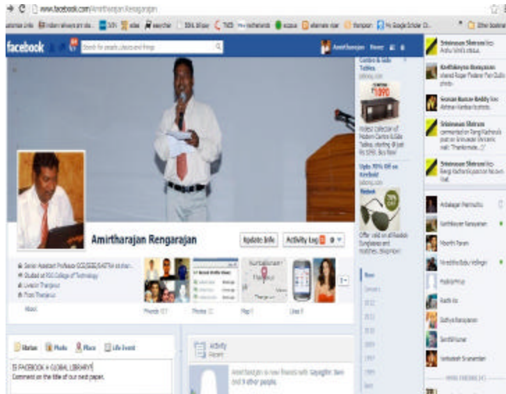
Fig. 1: Snapshot of the facebook profile

student's reliability in addition to immediate apprehension. Studies are going on in this invited research area which analyses the essence of computer-liased teacher disclosure. Facebook is likely happened to be a worthy asset to abide academic alliance with faculty. Findings indicate that the latter's self-revealing tendency may stimulate students for efficacious learning by means of interactive sessions (Mazer et al. , 2009; Roblyer et al. , 2010).